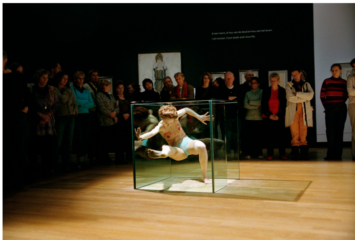
De Chatel Group: "Gradual and Persistent Loss of Control" Van Gogh Museum,2005

So, when you entered the museum's building, after passing through the security zone you were almost immediately in front of dancers of De Châtel group. Visitors were able to see contemporary dancers making such a distorted body movements. Some of them were in the glass cubes, specially designed for that exhibition, some of them were performing on the cubes mostly dressed in specially designed costumes to allude on Schiele's paintings and drawings.