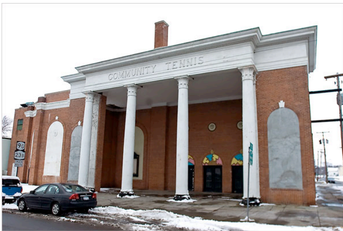
Former Theatre Building Hudson, New York,2007

However, Abramovic wouldn't like to wait for such a long period just to clean the factory and what about preparation, furnishing, installations and sure she didn't want to pay such a huge amount of money just for an empty and ruined building,even if the factory is situated in New York City. She asked herself , why that building must be situated in New York City or Brooklyn. She has also explained that Robert Wilson, the worldwide notorious choreographer, has a Foundation two hours by train from New York City and, however, Watermill Foundation is frequently visited by the public from all over the world.