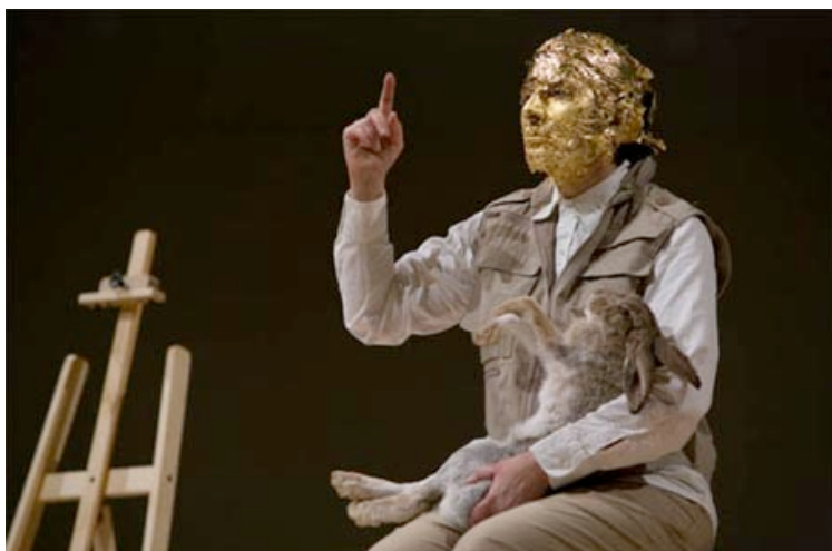
Marina Abramovic- How to Explain Pictures to a Dead Hare” Joseph Beuys, 1965, Guggenheim Museum 2005