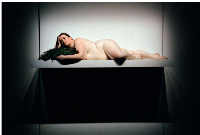
Herma Wittstock "Fan Me" Van Gogh Museum Amsterdam 2005

"Using the shelf, mounted to the wall, I pose in different positions, between nude modelling and pornography. I am surrounded by male and female inflatable sex-dolls. As I myself am changing the position, I also change the position of the inflatable sex-dolls and either dress or undress myself, as well as the inflatable sex-dolls. The dress consists of underwear, stockings and shoes." Anna Berndtson