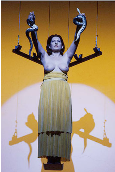
Marina Abramovic- The Biography -Remix Theatro Paladium, Rome, 2004