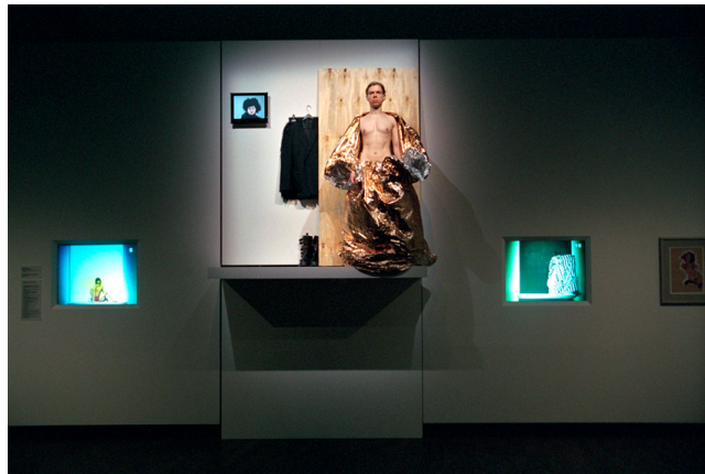
Ivan Civic -"Trespassing loss of control" Van Gogh Museum, Amsterdam 2005

"trespassing loss of control... There is a thin line, out there somewhere. It is fluid and yet definite. Life goes on and all seems to fit in each day routine. It's a typical day in the life of a family. Everybody belonging to the family follows certain rules... It has been like that since the dawn of man. Sometimes, those rules are broken because we lose control upon ourselves. The family suffers a crisis. After some time we try to "make things good again", we try to regain control. Only then we trespass that thin line. We trespass the loss of control. The entire piece was about being contained in a closed space, meaning also emotionally, and not being able to break out. I was inspired by Egon Schiele's obsessive bonding to his models, wife, mother..."